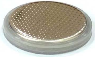
Upper Cap (Negative Case )