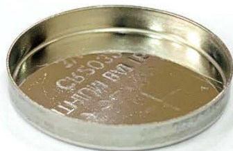
Bottom Case (Positive Case)